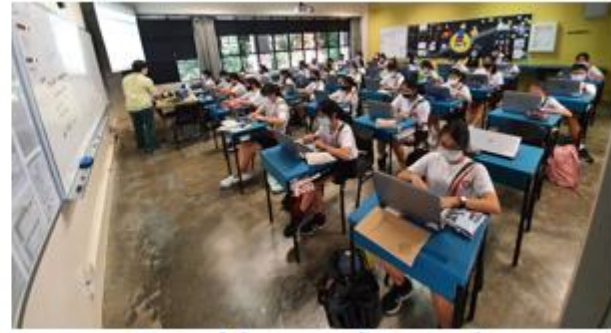
Teaching and Learning