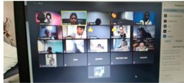
Home based learning (HBL)